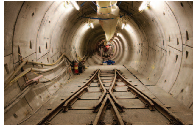
Concrete provides solutions for all areas of the built environment, including vital infrastructure projects.